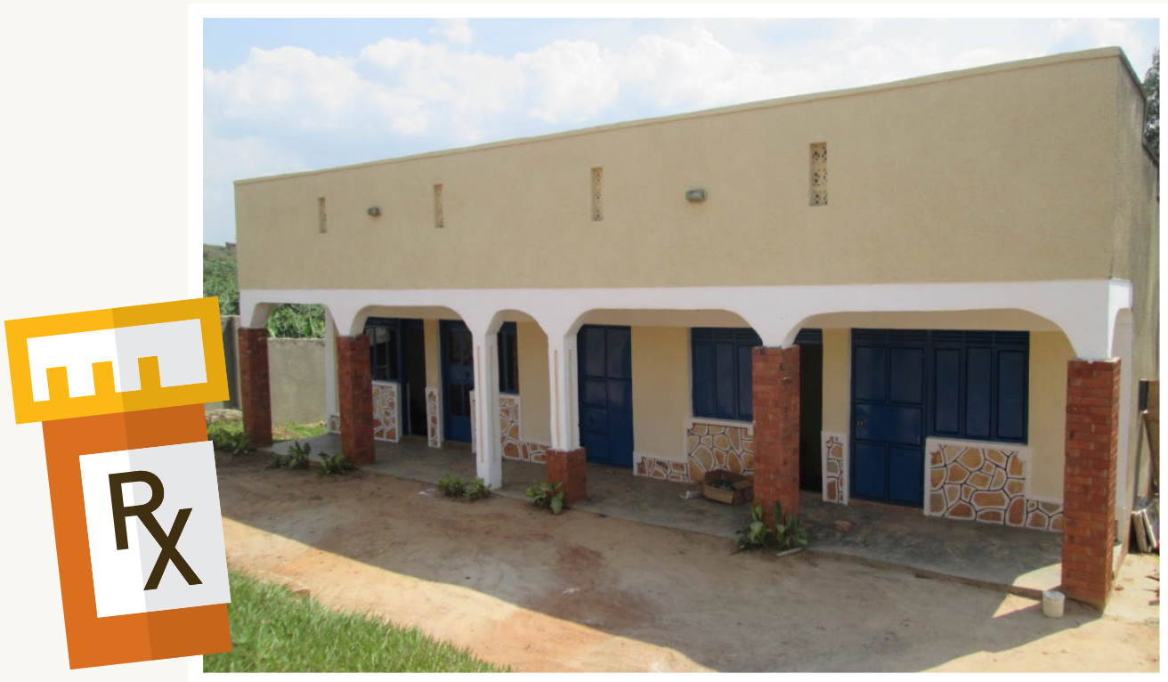
New Covenant Mercies Medical Clinic in Kiburara, Uganda